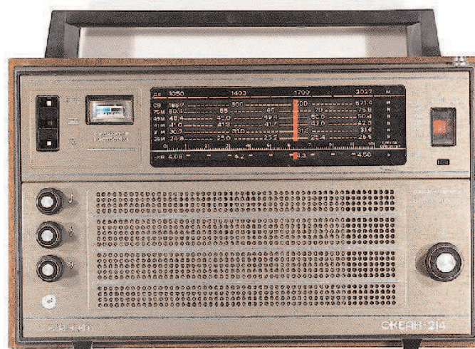
Fig. 1. The radio that has been used in this study.